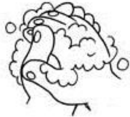
Se frota al frente y fondo de sus manos y en medio de sus dedos