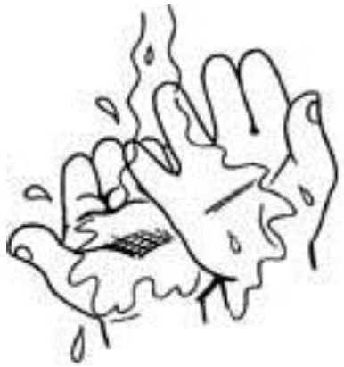
Mojase las manos con agua