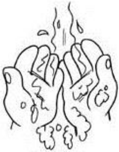
Enjuagase las manos