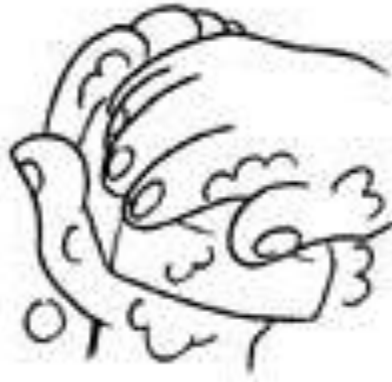
Usa suficiente jabon